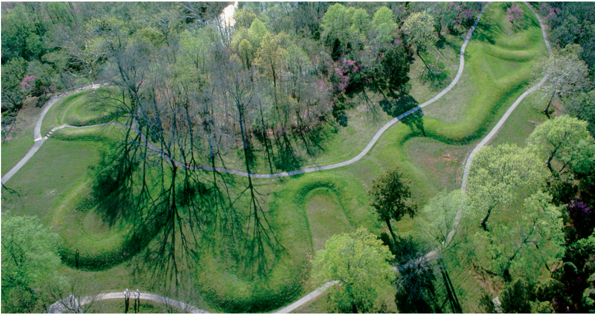
▲ Great Serpent Mound runs some 1,300 feet along its coils and is between 4 and 5 feet high.

people lived at Cahokia (kuh•HOH•kee•uh), the leading site of Mississippian culture. Cahokia was led by priest-rulers, who regulated farming activities. The heart of the community was a 100-foot-high, flat-topped earthen pyramid, which was crowned by a wooden temple.